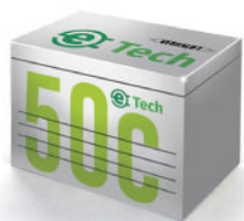
e-Tech battery solution