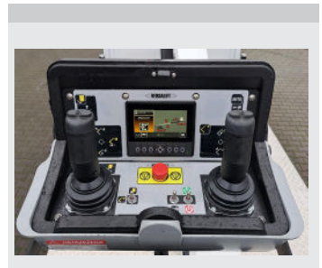
XPC controls with up to 4 actions at a time (2 per joystick)