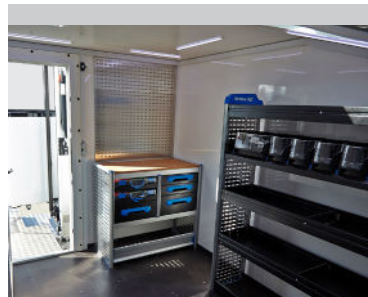
Workshop interior (optional)